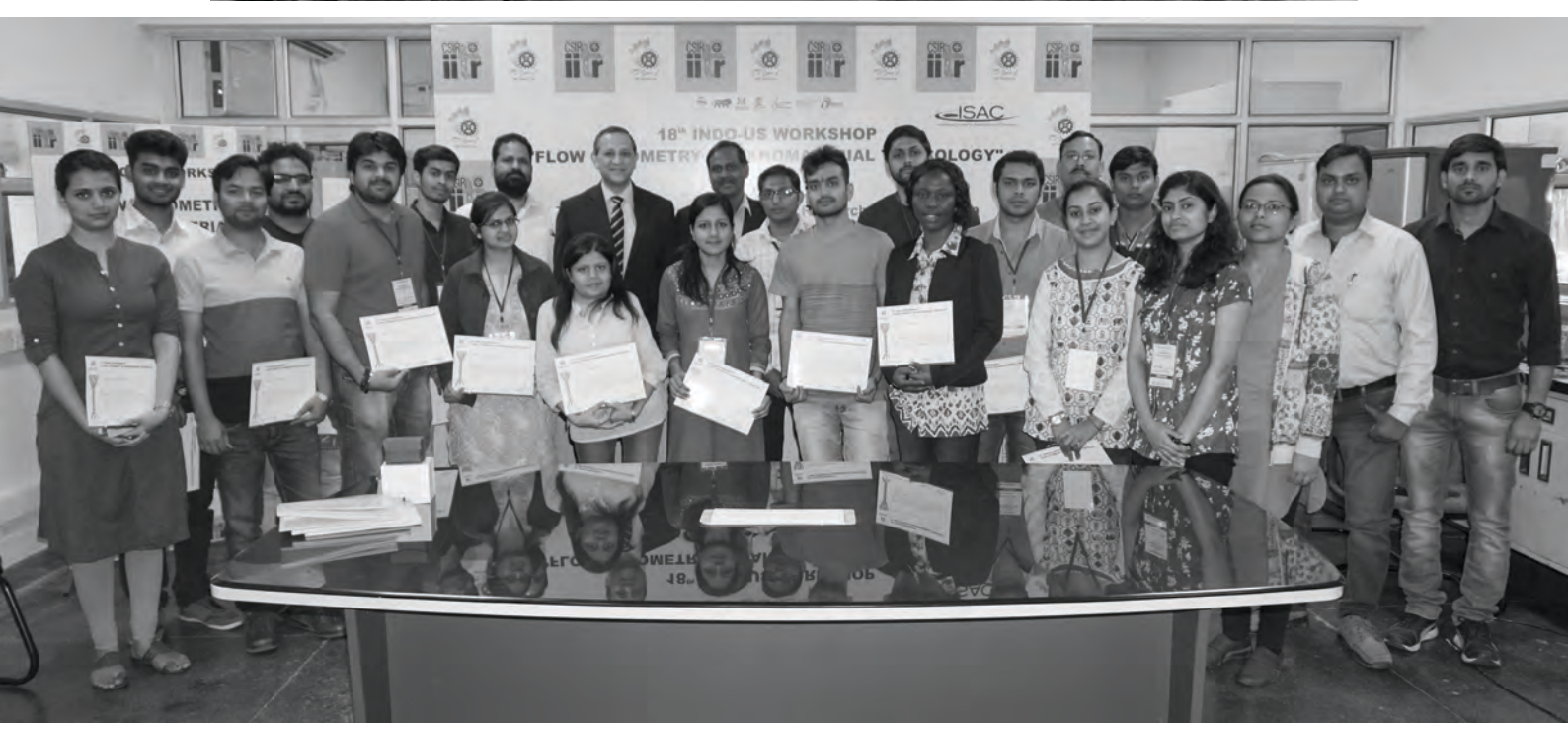
Interactive sessions among the participants and speakers.