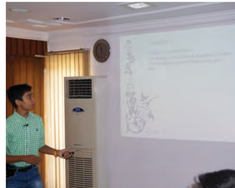
Students presenting their idea and project proposals.