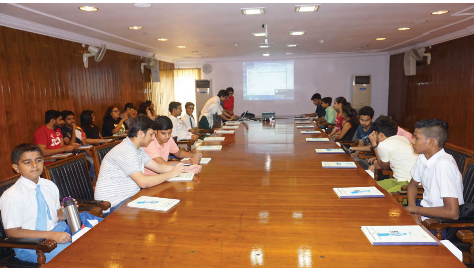
Students discussing their ideas.