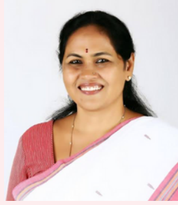
Sushri Shobha Karandlaje Minister of State Ministry of Labour and Employment & Ministry of Micro, Small and Medium Enterprises